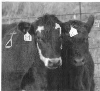
The STEER Brand marks cattle set aside for missionary support

The mission society you represent must be on STEER's membership list. To become a member, your mission must make application with STEER and be approved by our General Board of Directors. Contact the STEER office for more details about this process.